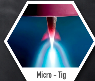
Micro - Tig