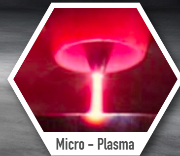
Micro - Plasma